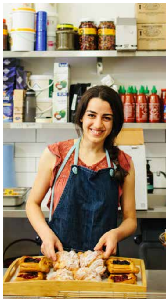
Kinfolk's café business supports volunteers to gain skills and confidence

'A small, incidental spend by a government department can be game changing in terms of social outcomes.'