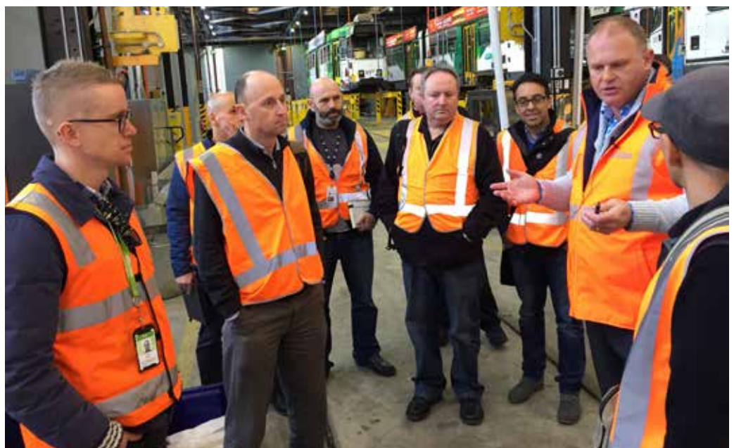
Auto workers visiting Yarra Trams as part of the TRANSIT program in 2017

'TRANSIT allows workers from different industries, including the automotive sector, to really get a feel for what it means to work in transport.'