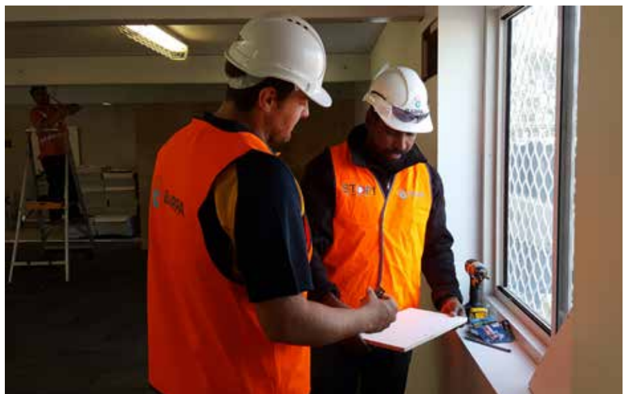
Barpa employees on site at the Mernda Rail Extension Project

'For example, we want to do full construction projects of larger scale, as they provide more opportunities for training and employment of Indigenous staff.'