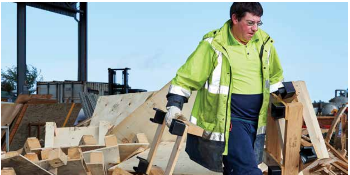
An Outlook Environmental employee hand-picks recyclable materials from construction waste

'Everyone's good at something. They've just got to find out what they're good at.'