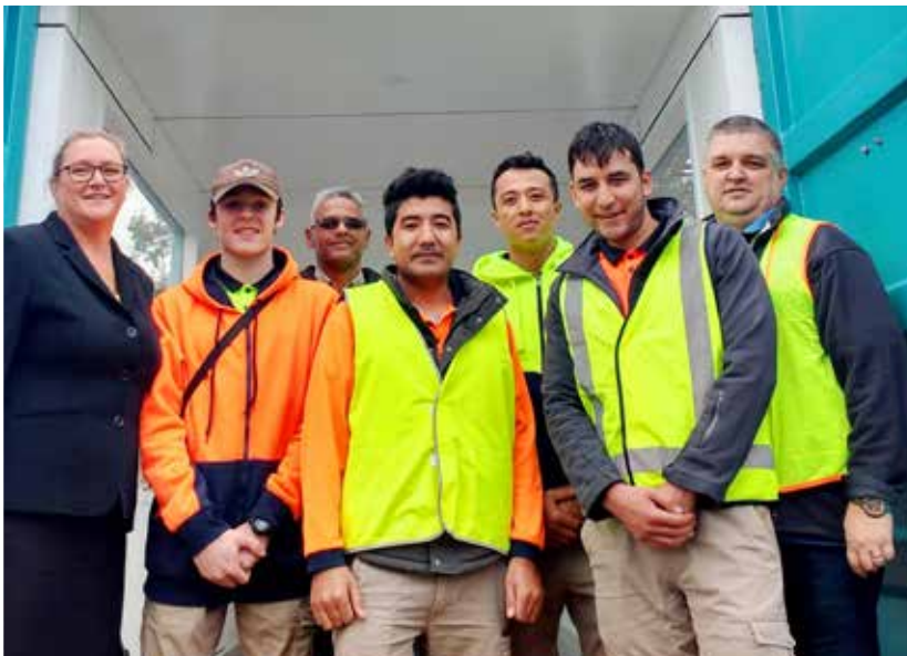
TRY Australia trainees gain experience in construction

'The stability that these projects have provided for our business makes our social enterprise viable and enables us to employ these kids in long-term jobs.'