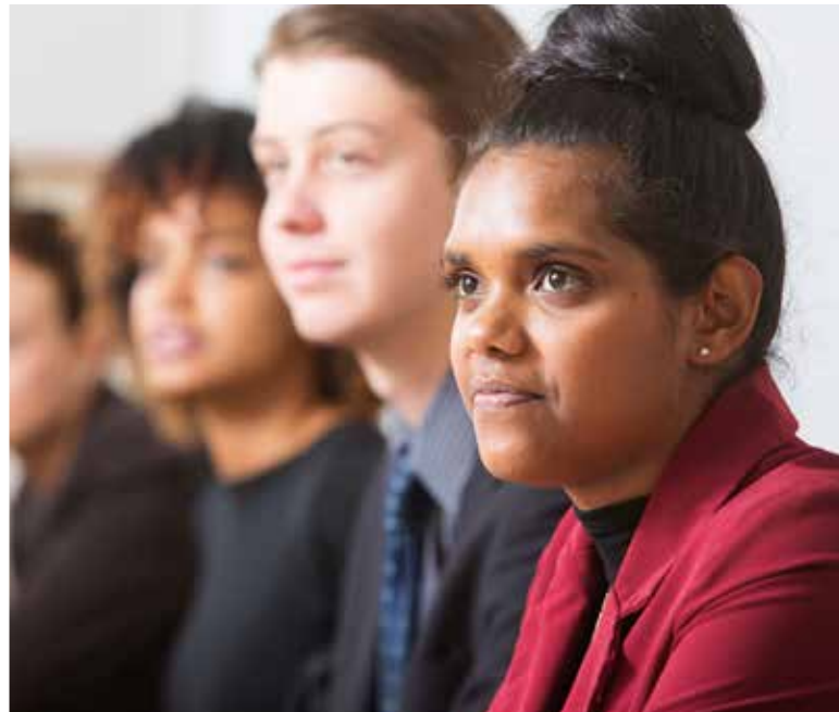
Social procurement in action: RAW Recruitment community stakeholders attend a workshop

'For example, people often come to us for help when they're bidding for work because some procurement policies require three years of financials. We partner with them so they can meet that requirement, but this sort of thing can be a real barrier for Aboriginal startups.'